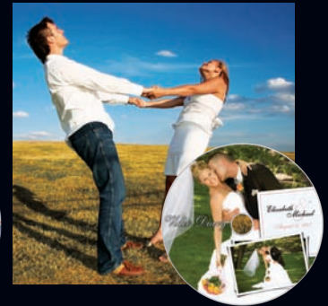
Family & Business Event Videos