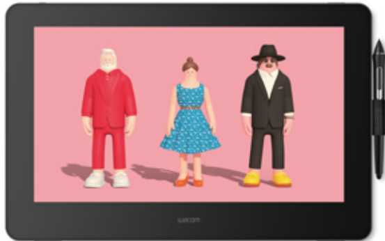
Wacom Cintiq Pro 16 Featured artist: Superfiction

When creativity strikes, you want to bring your vision to life effortlessly. That's why we've refined Wacom Cintiq Pro 16 to make it even more comfortable and natural to work on. With enhanced ergonomics and an intuitive pen-on-screen experience, you can fully immerse yourself in your craft.